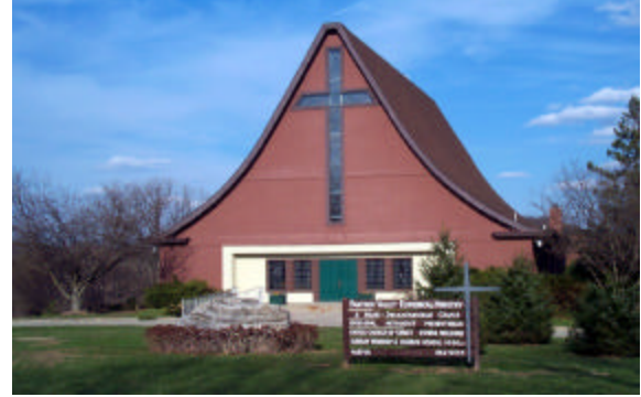
Panther Valley Ecumenical Church

(A multi-denominational Church) 1490 Route 517 P O Box 463 Allamuchy, NJ 07820 (908) 852-5444 www.pvem.net